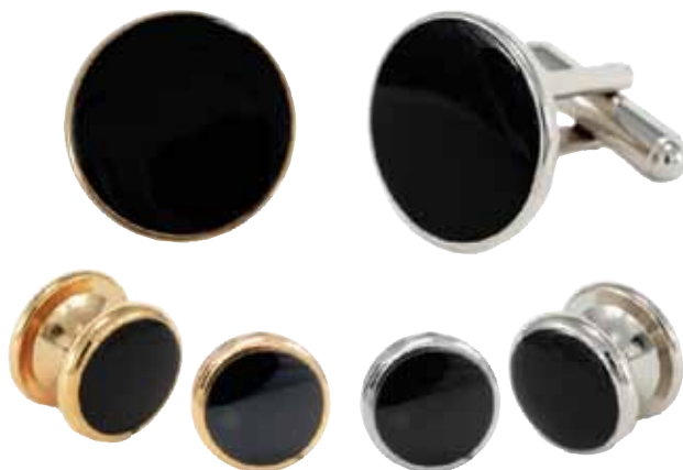
E400 The classically bold black or white epoxy center in gold- or silver-colored round settings makes this a great choice for your customers who want subtle yet eye-catching accessories. This item is also available bagged, with 2 cuff links and 4 studs.