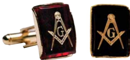
M100 The unmistakable Mason insignia inlay with our Pioneer Select epoxy studs in jet, ruby or sapphire commands respect for your customers who have earned Masonic membership; available in a gold setting.