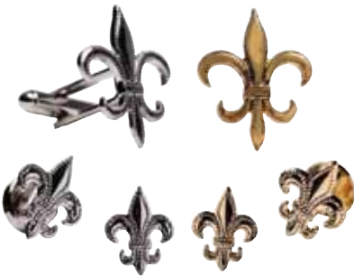
N331 The textured detail of our fleur-de-lis cuff links and studs complements the beauty of the centuries-old symbol itself, making this an ever-popular item.