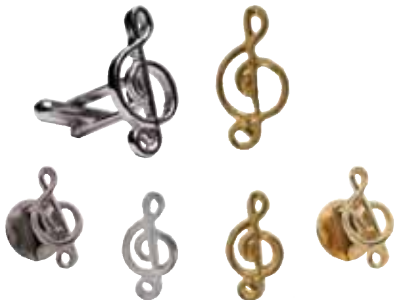
N308 The attractive Pioneer Select treble clef cuff links and studs are perfect for musicians and music lovers alike.