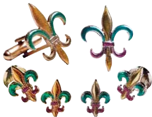
N331-MG The Pioneer Select fleur-de-lis cuff links and studs with gold, green and purple epoxy reflect the colorful grandeur and festive atmosphere of any good Mardi Gras celebration.

E415-MG Rectangle with gold, green and purple epoxy