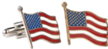
N332 The patriotic Pioneer Select American flag cuff links let proud citizens show support for the country they love.